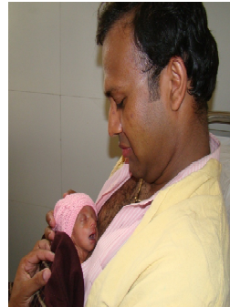
Father providing KMC

KMC provider should be willing, in good health, free from serious illness and should maintain basic standards of hygiene.