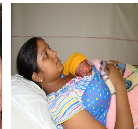
KMC while resting