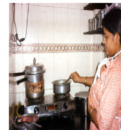
KMC during household work

It is better for the person giving KMC to be at an angle of 30°. But she/he can walk and continue other activities.