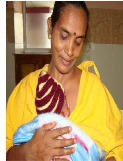
Grand-mother providing KMC